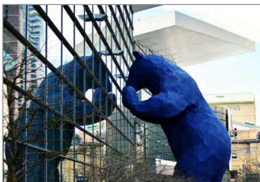
Left: Morrison Red Rocks Park ten miles west of Denver.