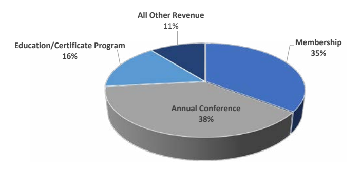
Figure 1. Sources of program revenue for the fiscal year that ended June 30, 2020.

Reserves are the accumulation of funds over time that enable an organization to withstand an emergency or to invest in new mission-related initiates. Unrestricted reserves of 6 to 12 months of annual operating expenses represent a standard target for not-for-profit organizations. With budgeted annual operating expenses of $1,615,950 for the fiscal year from July 1, 2020, to June 30, 2021, the target for AMWA's reserves ranges